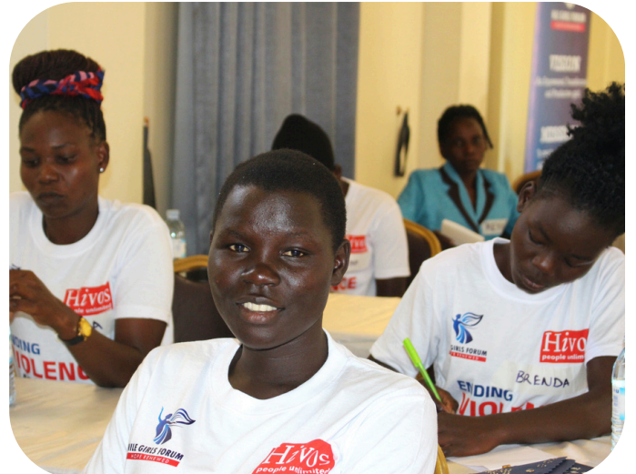
Peer Pals from Terego during a training