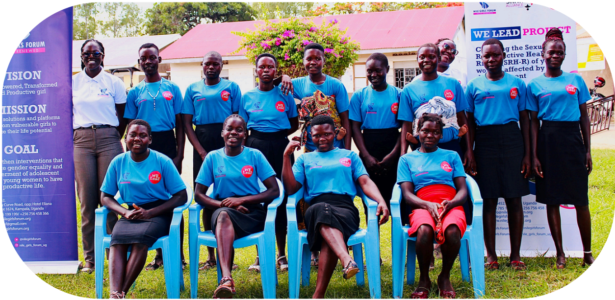
Peer Pals affected by displacement from Arua District