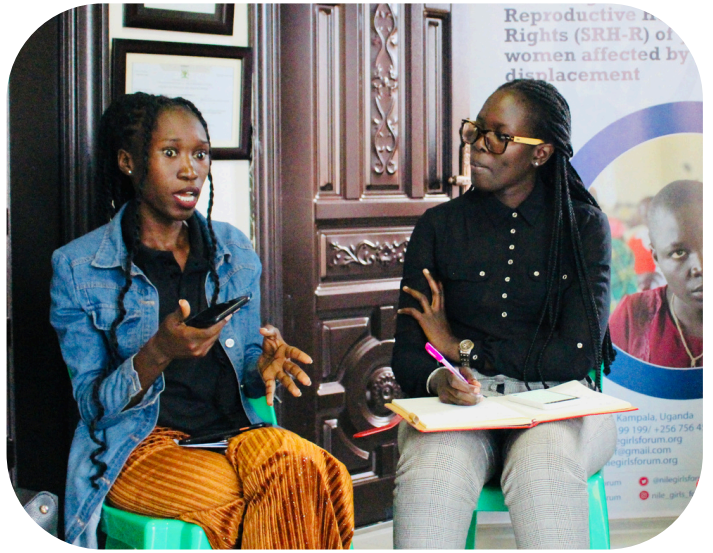
Patience and Faith during a FGD of Restless Development Uganda