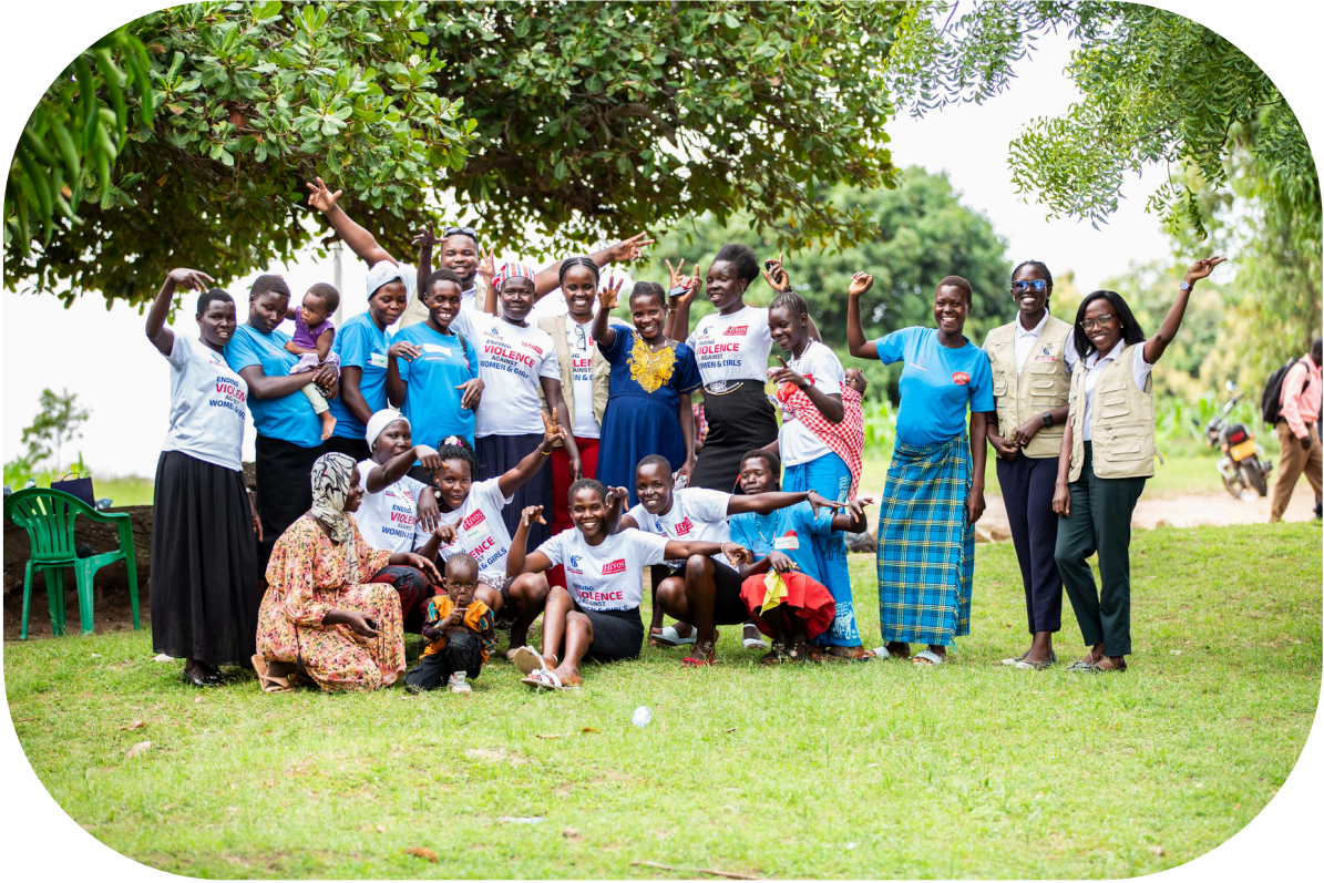
Peer pals affected by displacement in Terego district