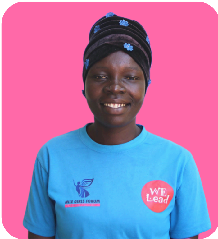
OCOKURU LILLIAN TEREGO DISTRICT