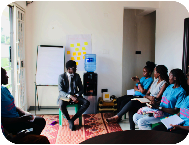
Session on climate justice