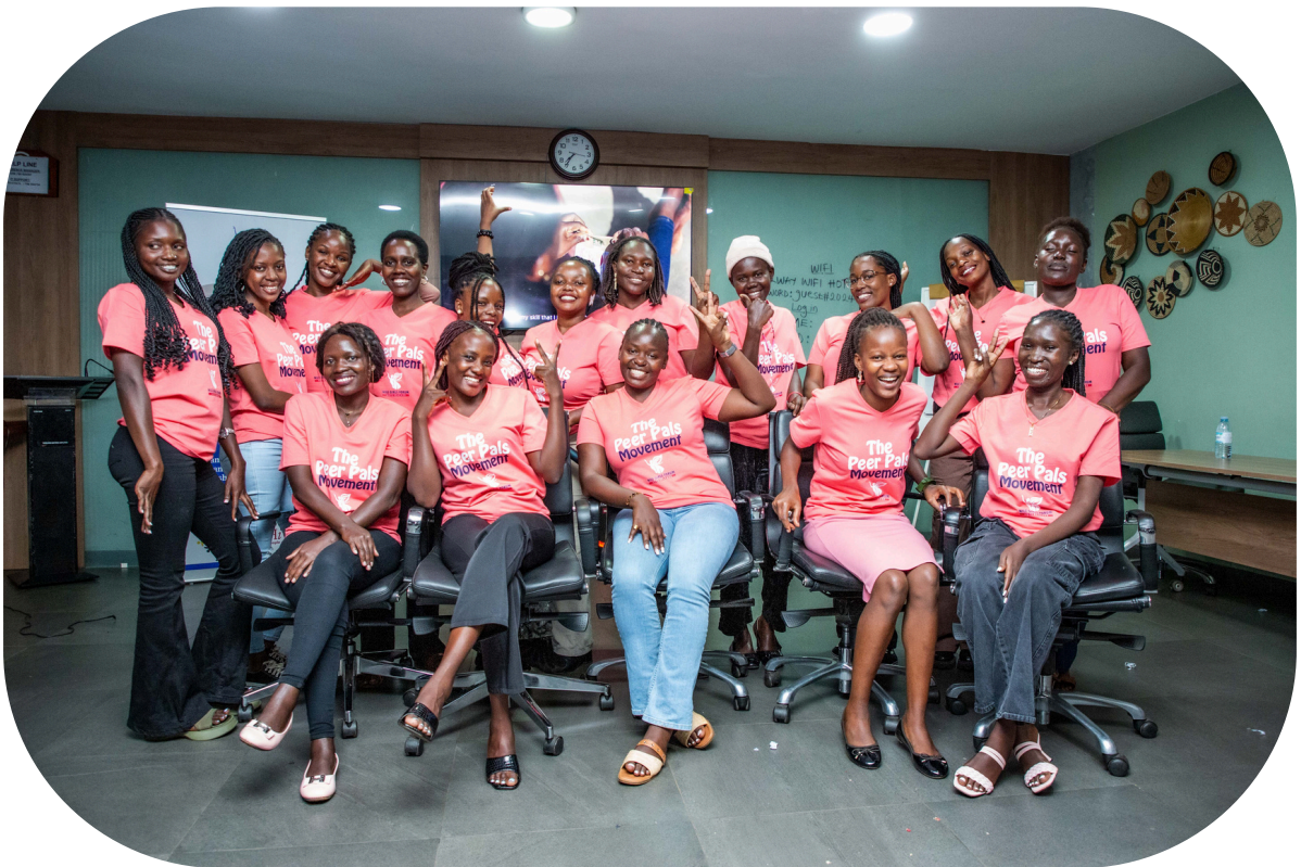
Peer Pals group photo in Kampala