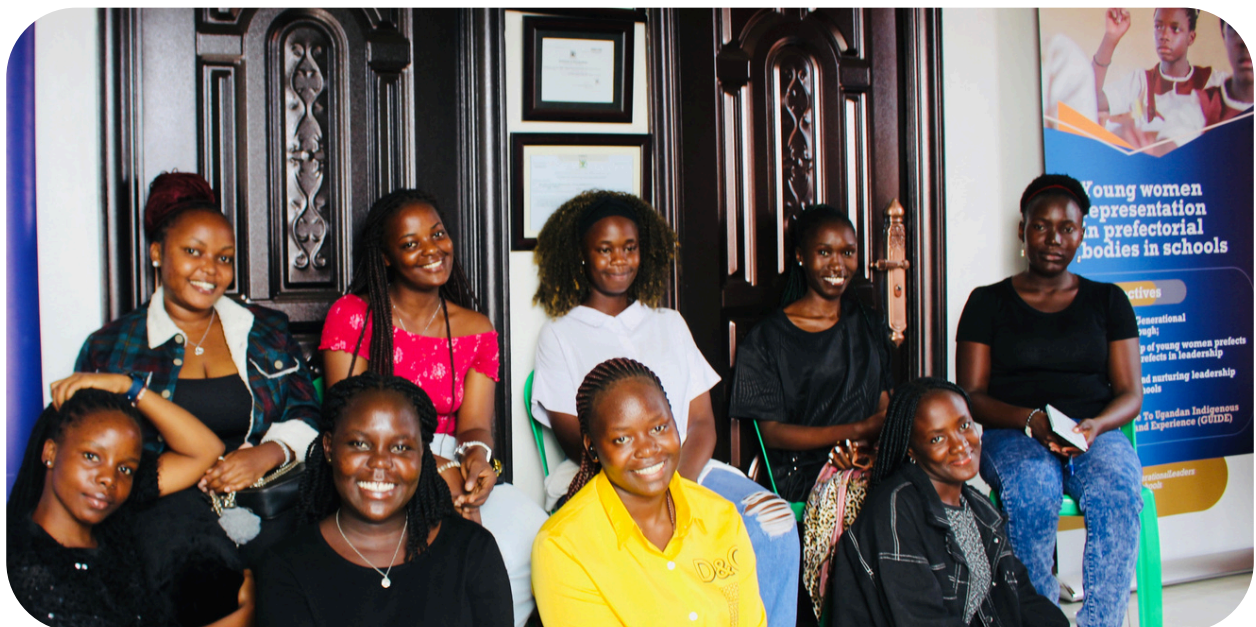
Some of the Peer Pals from Kampala City, some of them live in urban slums