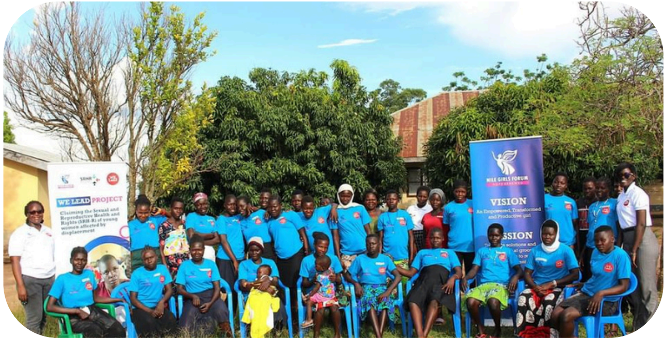
Peer Pals affected by displacement from Terego District