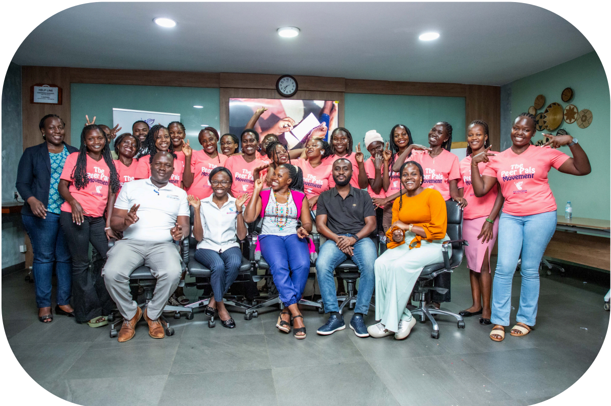
A group photo with peer pals in Kampala