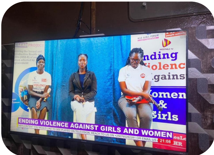
Peer Pals on West Nile TV