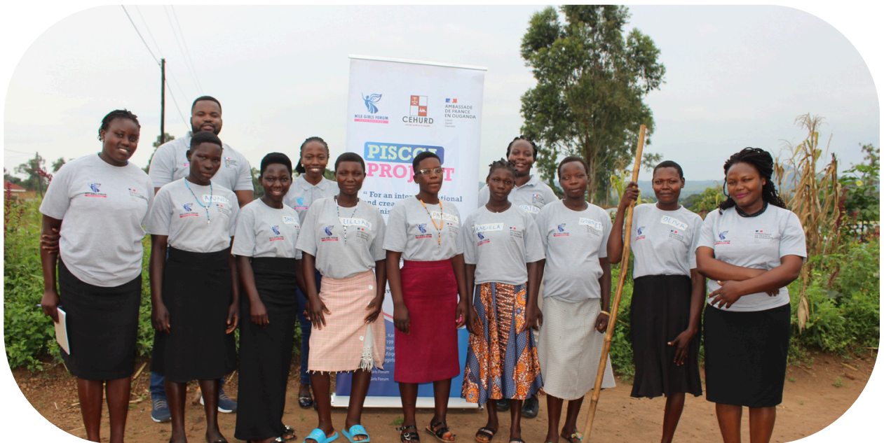
Peer Pals with disabilities from Zombo District